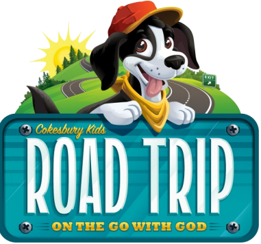
Vacation Bible School 2025